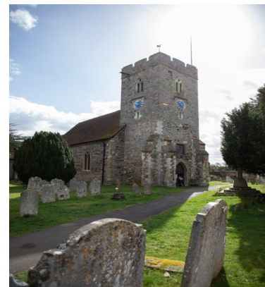
St. Peter's Church Old Woking; 900 year old church with original Anglo-Saxon oak door